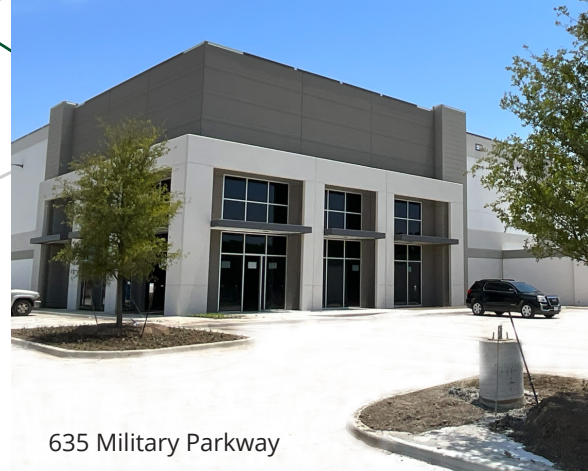
635 Military Parkway