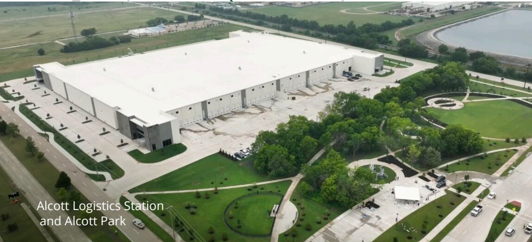
Alcott Logistics Station and Alcott Park

MESQUITE T E X A S Real. Texas. Business.