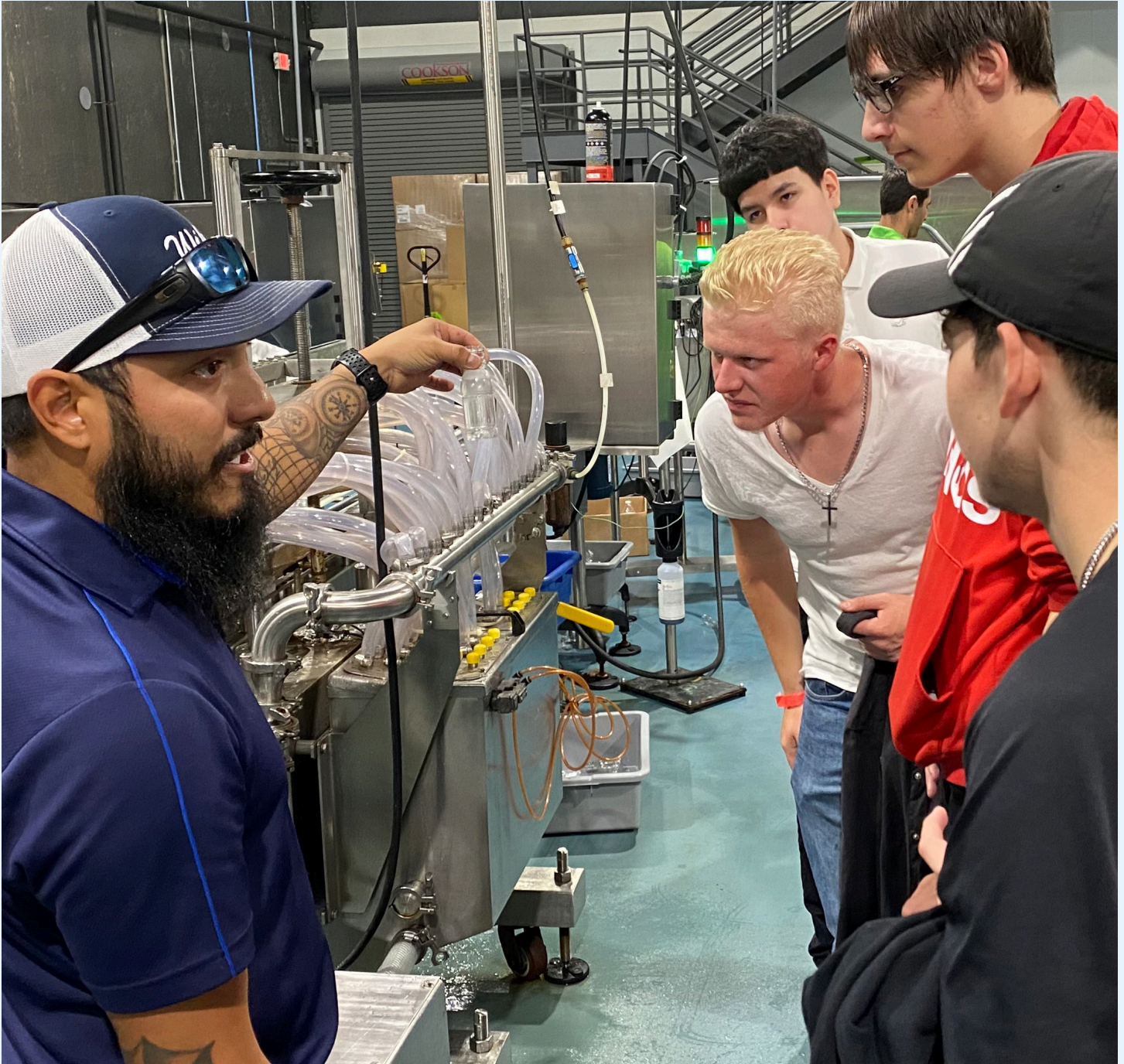
Mesquite Independent School District Career and Technical Education students touring Pickle Juice as part of Manufacturing Day.

Contact 972.216.6446 lwoodward@cityofmesquite.com