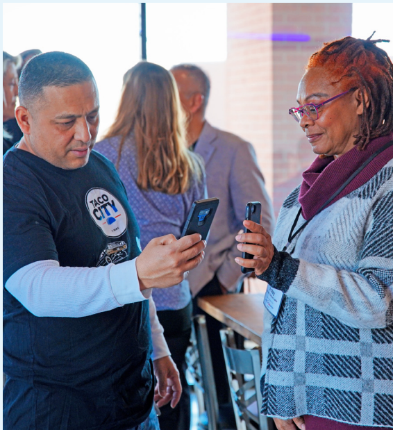
Workforce Solutions Greater Dallas exchanging information with Taco City Mas as part of a business meet and greet.

To the right you will find services that each task force partner provides to the business community.